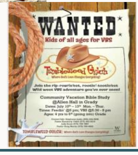
Crossroads Cowboy Community Church of the Nazarene