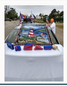
Mountainair Living Hope CON 4th of July Parada