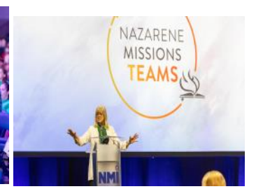
W&W Name Change