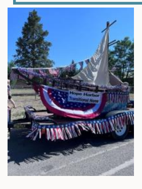
Hope Harbor in the 4th of July Parada